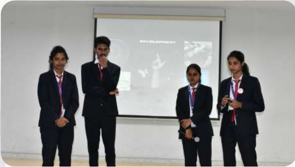
Event 'Project Presentation'