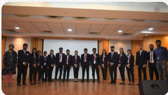
Event Tech Rounds