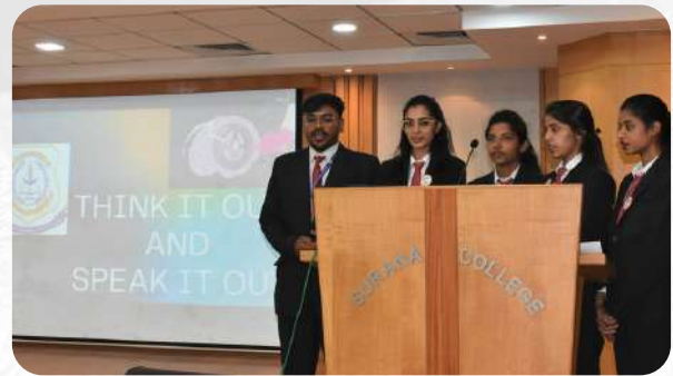
Event 'Think it out and speak it out'

Teams compete against each other every week in various activities and competitions organized by the students. A season begins with a formal inaugural function and ends with a valedictory ceremony where the winners are awarded.