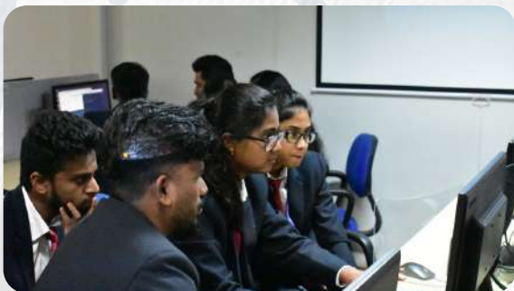
Event Blank Coding