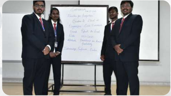
Event 'Speak to Lead'