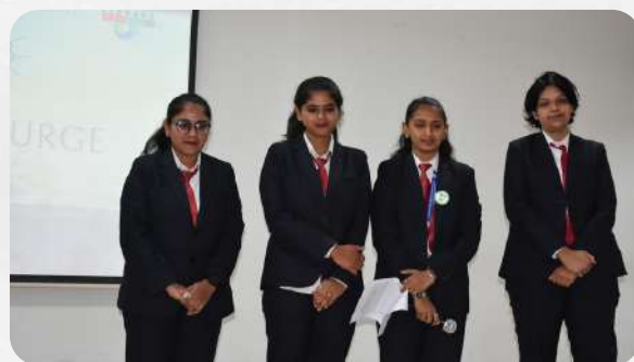
Event Brain Surge