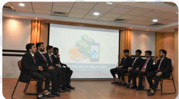
Event 'Group discussion'