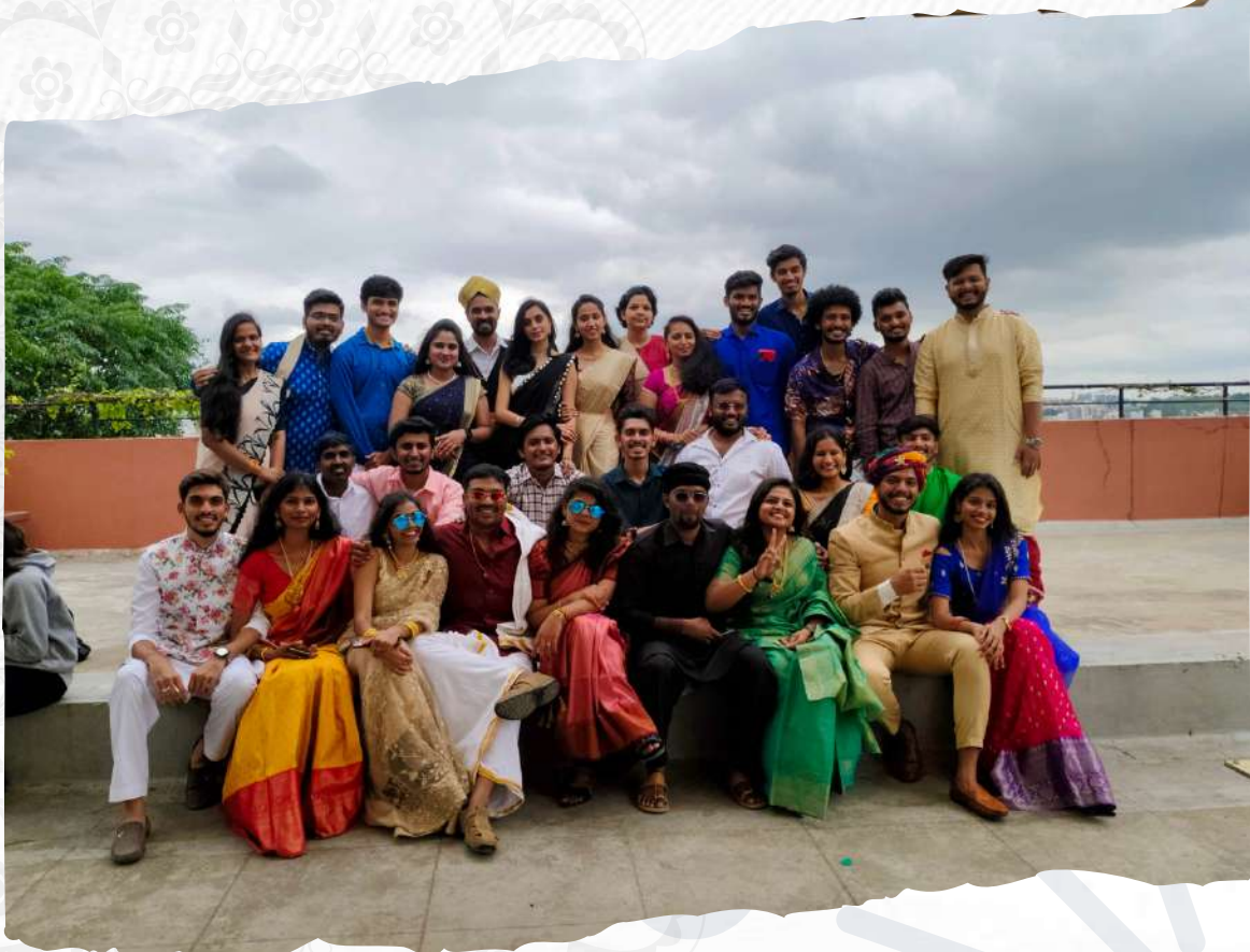
Students of final year MCA in Ethnic attire.

Ethnic Day is always the most awaited fest for students every year. we celebrated Ethnic Day on 13th September 2022, which is vibrant and exuberant day by wearing ethnic clothing. "Ethnic Day" to celebrate and rejoice the culture and values of our great nation. In addition to the beauty of the traditional attire. The event was conducted to bring out the tradition and moral values that we as Indians have learned as we grew up. The event was conducted to celebrate our Indian pride.