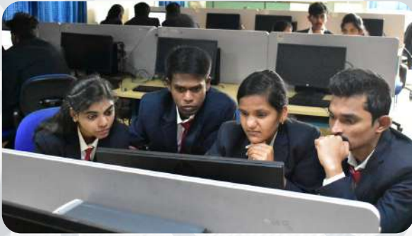
Event 'Break the Query'