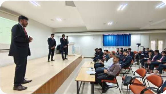
Event 'IT Manager'