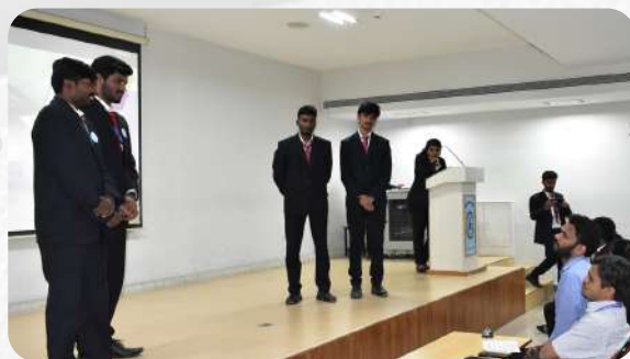
Event Project Presentation