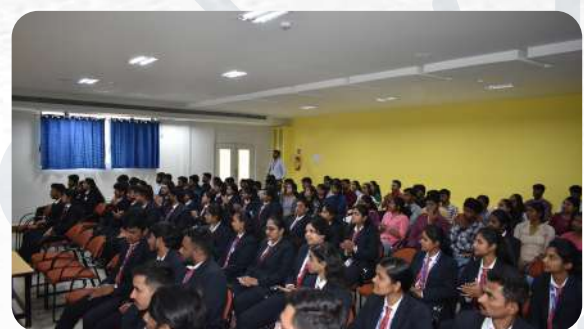
Event Case Study