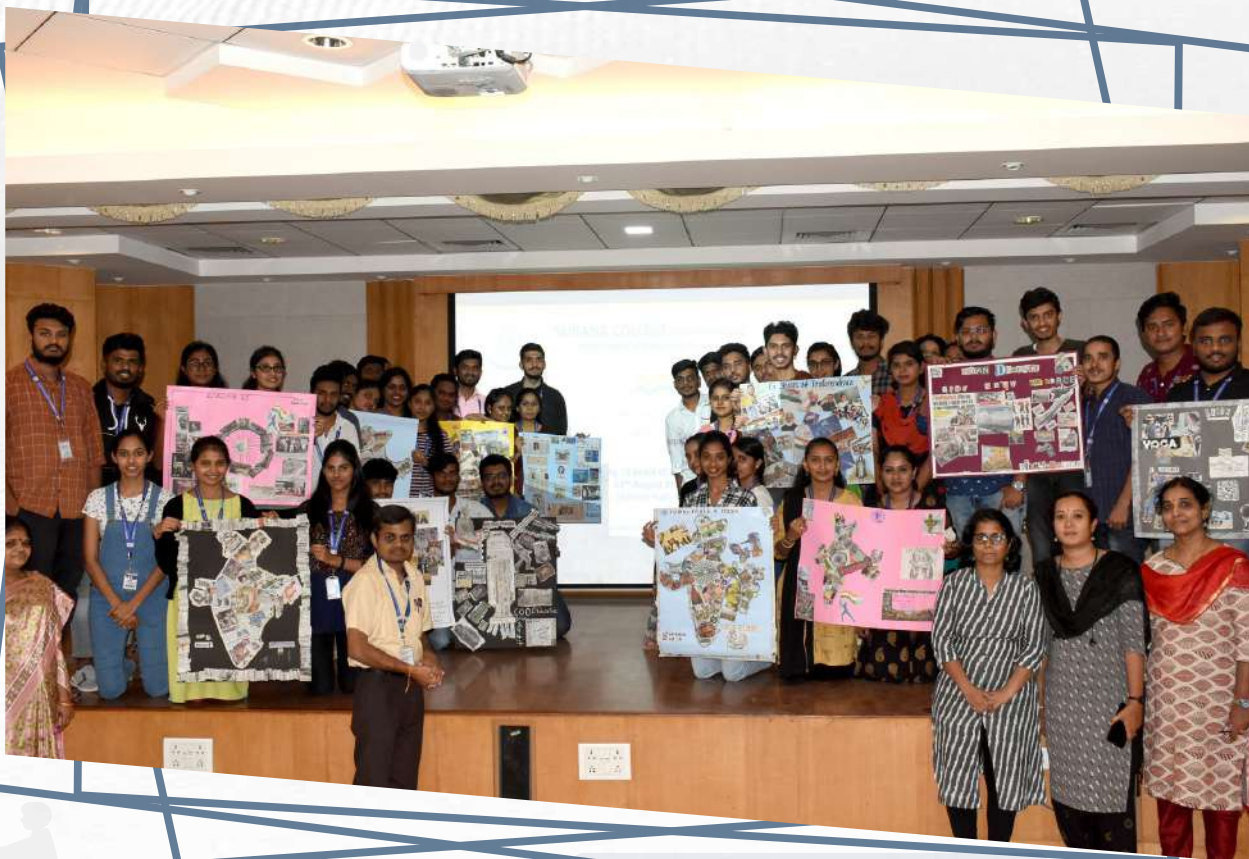
Poster show made on 75th year of Independence