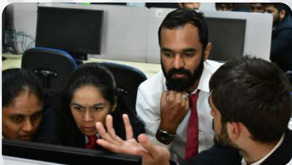
Event Spread-sheet Challenge