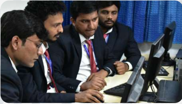
Event 'Logo design'