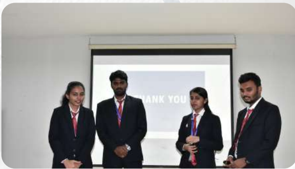
Event 'Project Presentation'