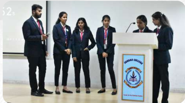
Event 'Tech Quiz'