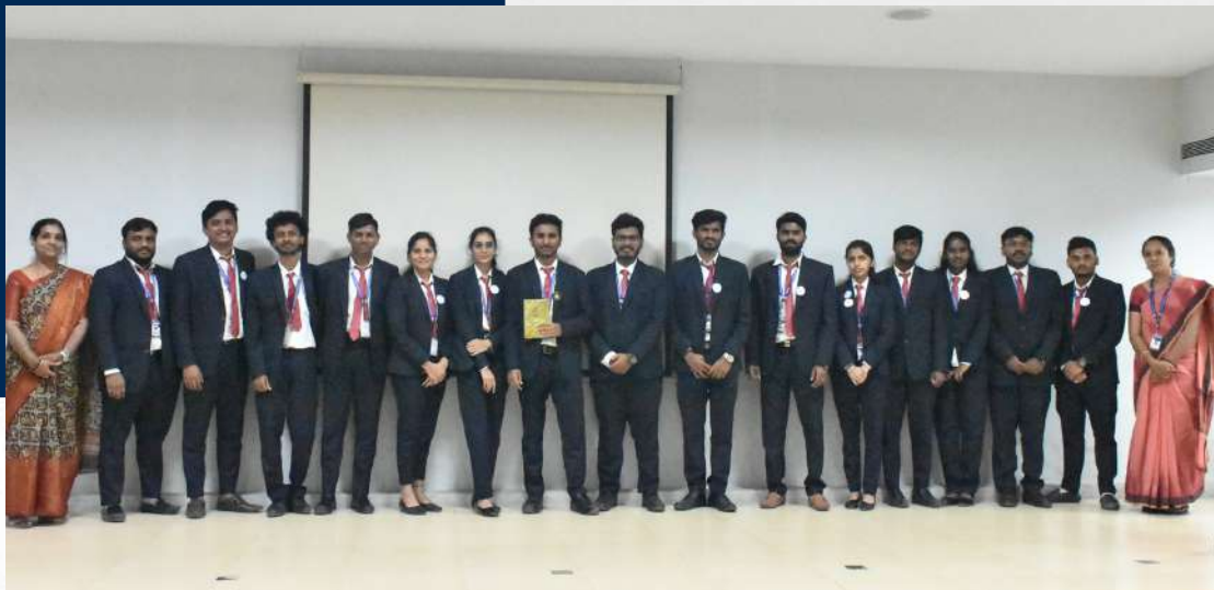
Event Tech Presentation