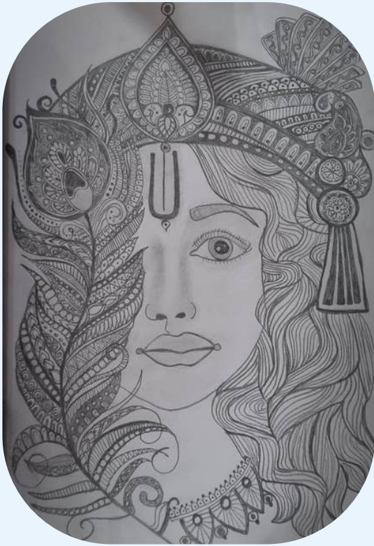
BY DEEKSHITHA B S 1 st Sem - MBA