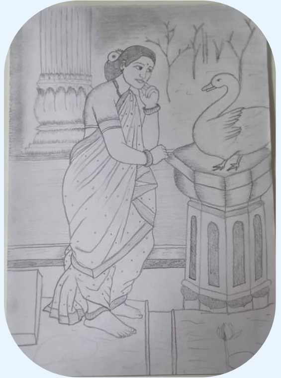
ANUPAM P 1 st Sem - MBA