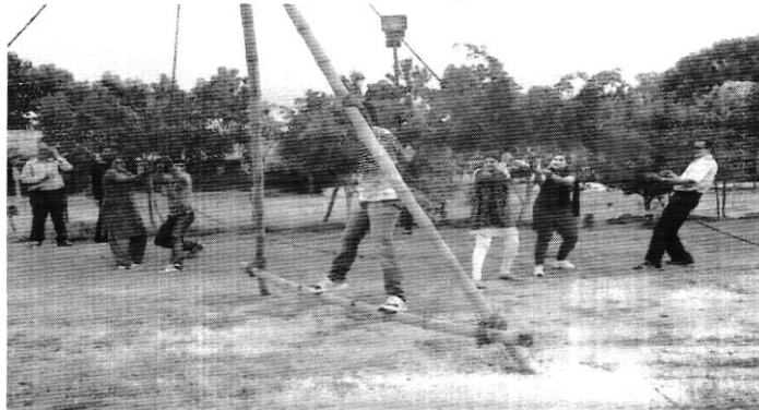
Celebration of Achiever's Appreciation Programme