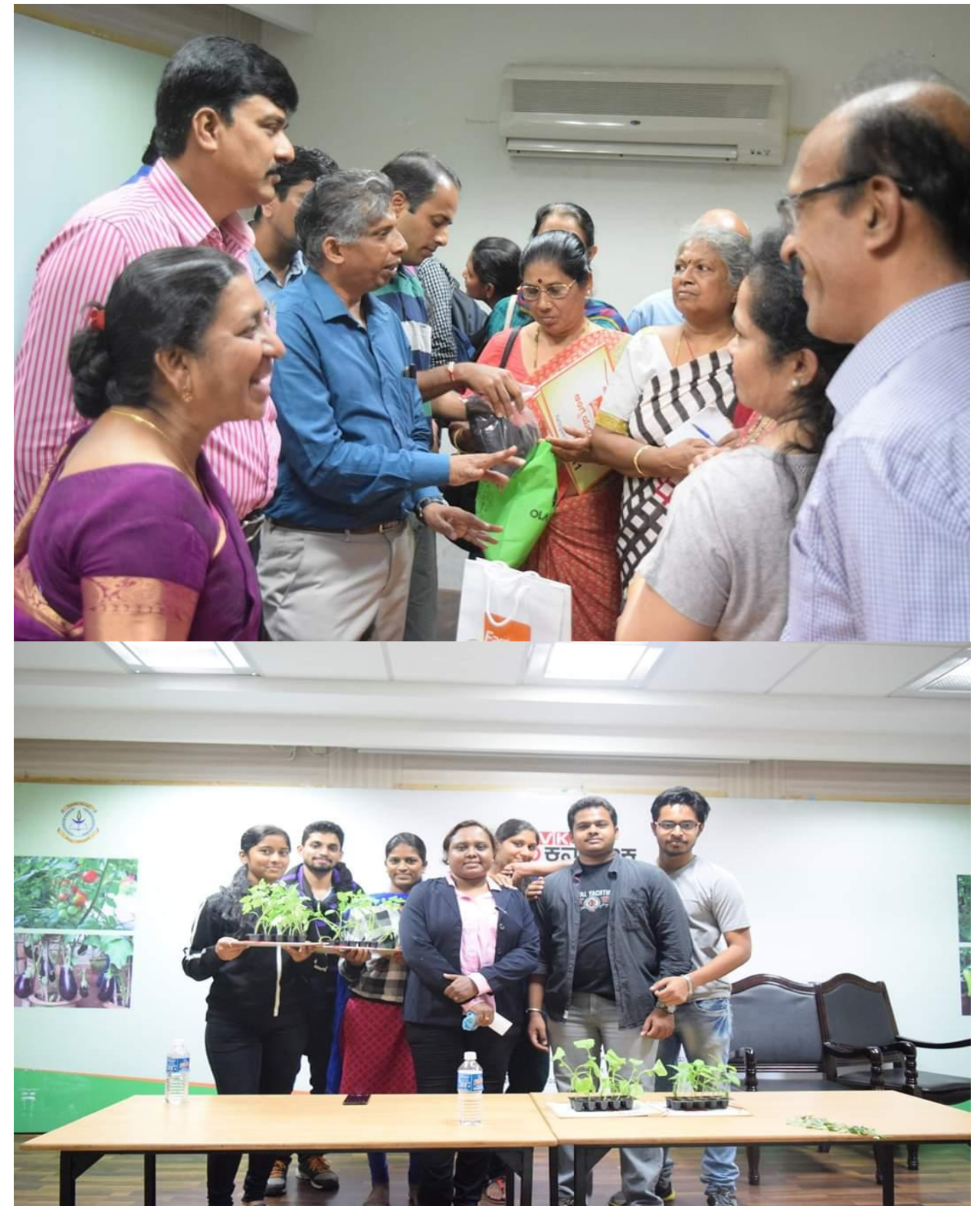
Seminar and training workshop on Kitchen Garden to the Public & the Students