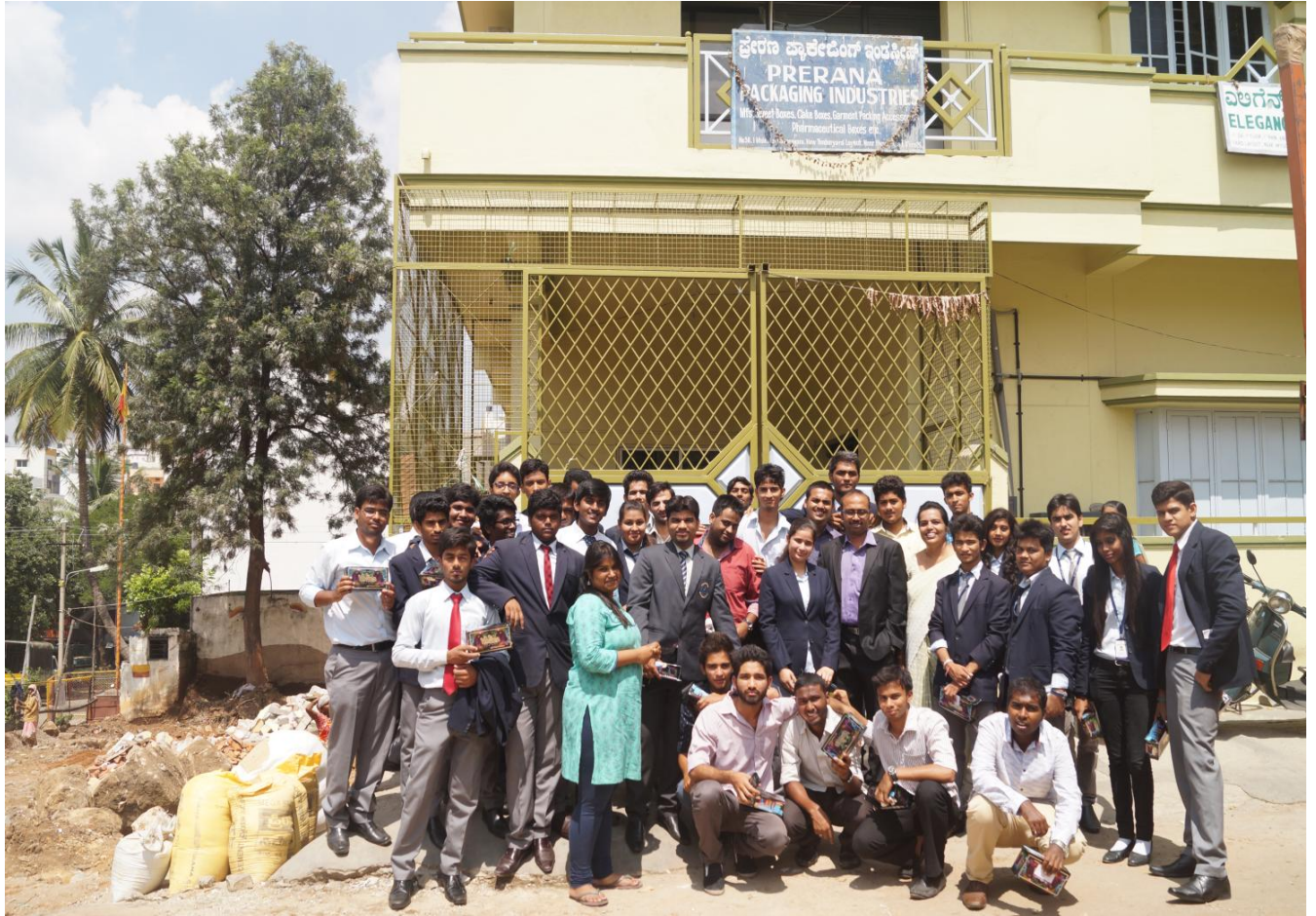
INDUSTRIAL VISIT TO PRERANA PACKAGING INDUSTRY & ELEGANCE EMBROIDERY-15/10/14