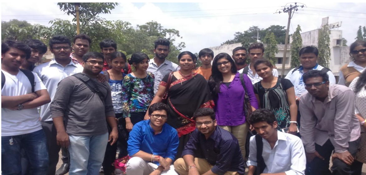
Students at Bio-park

Our 3 rd Semester BBA Students were exposed to a host of fields during this visit such as Environmental Biology, Environmental Chemistry, Environmental Pollution, Biostatistics, Waste Management, Remote Sensing and its applications, Natural Resource Management and Biodiversity, Disaster Management, Environmental Energy, and Conservation at Bio-Park (Chakravana) and Environmental Museum of Minerals & Rocks. This has enabled them to briefly understand the environmental concepts. This visit was part of their curriculum “Science and Society”.