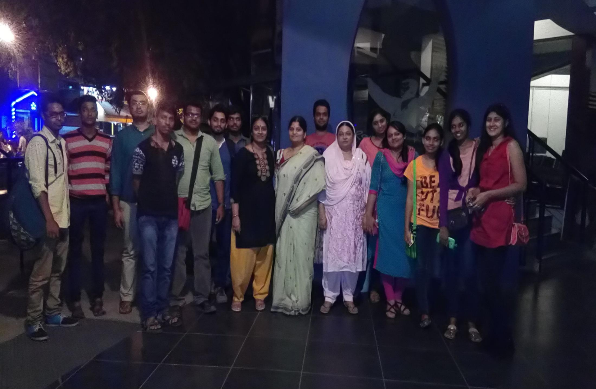
Theater Visit to Rangashankara on 24 Feb 2016 for 'The Glass Menagerie'